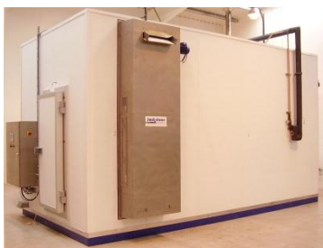
Pre-Assembled Package Type Spiral Freezer

Systems can be supplied either as package, pre-built units or site built, depending on customer requirements.